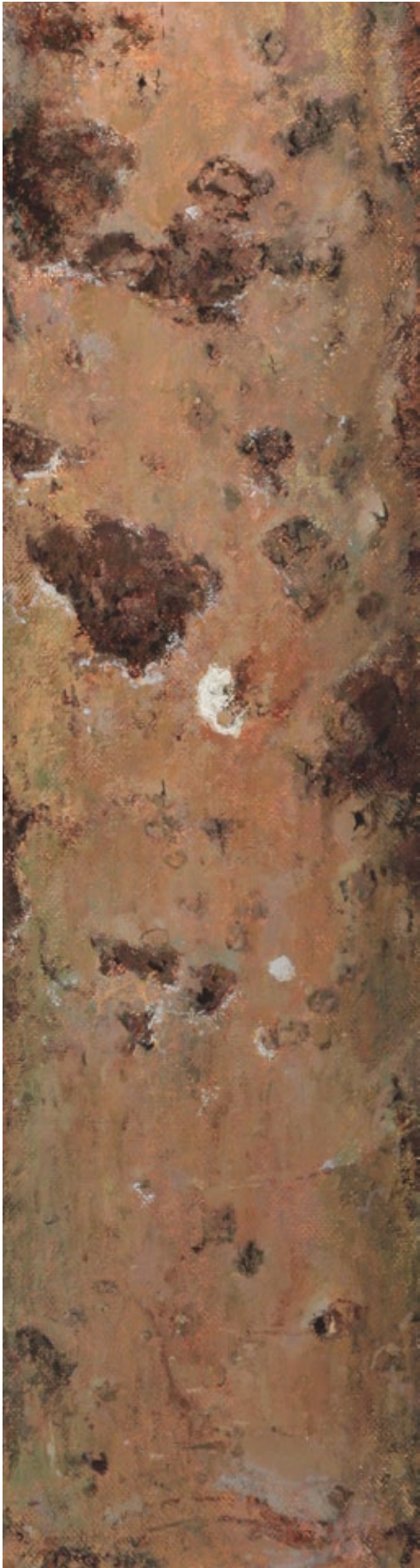
BEECH, OIL ON LINEN, 30 X 8¾"