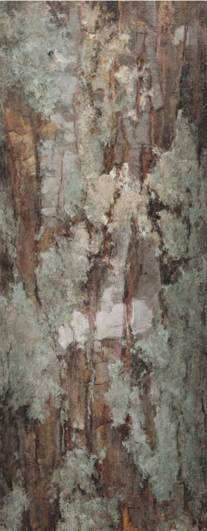
RED OAK, OIL ON LINEN, 30 X 12"