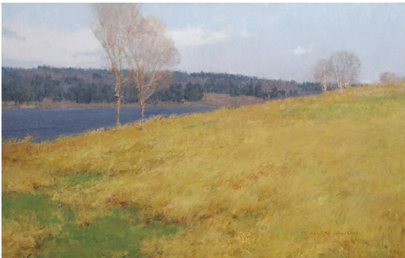
SPRING AT STONE'S POINT, OIL ON LINEN, 14 X 22"

The shift in technique is having an effect on his more traditional work as well.