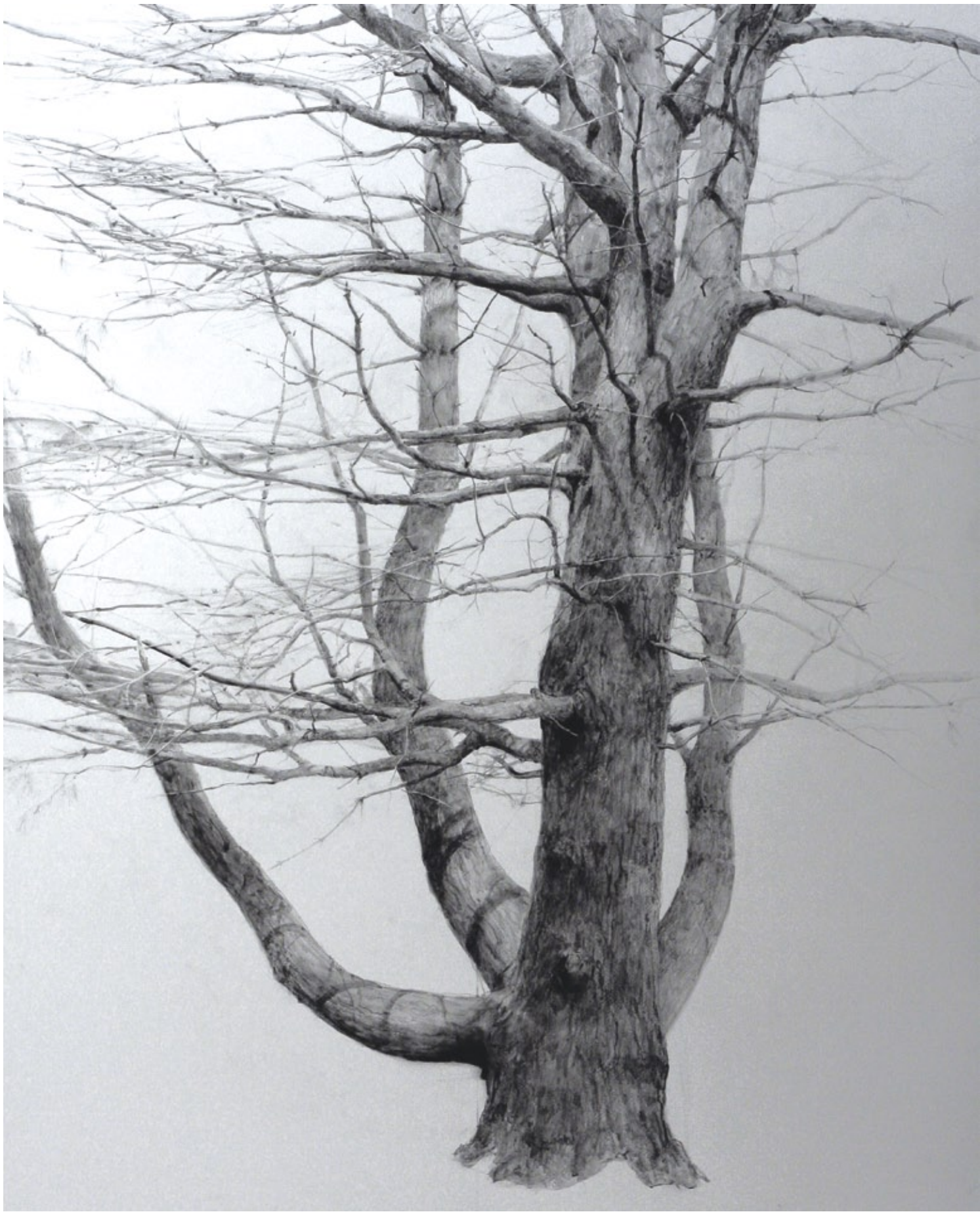
ISLESBORO GUARDIAN, PENCIL ON PAPER, 39 X 30½"