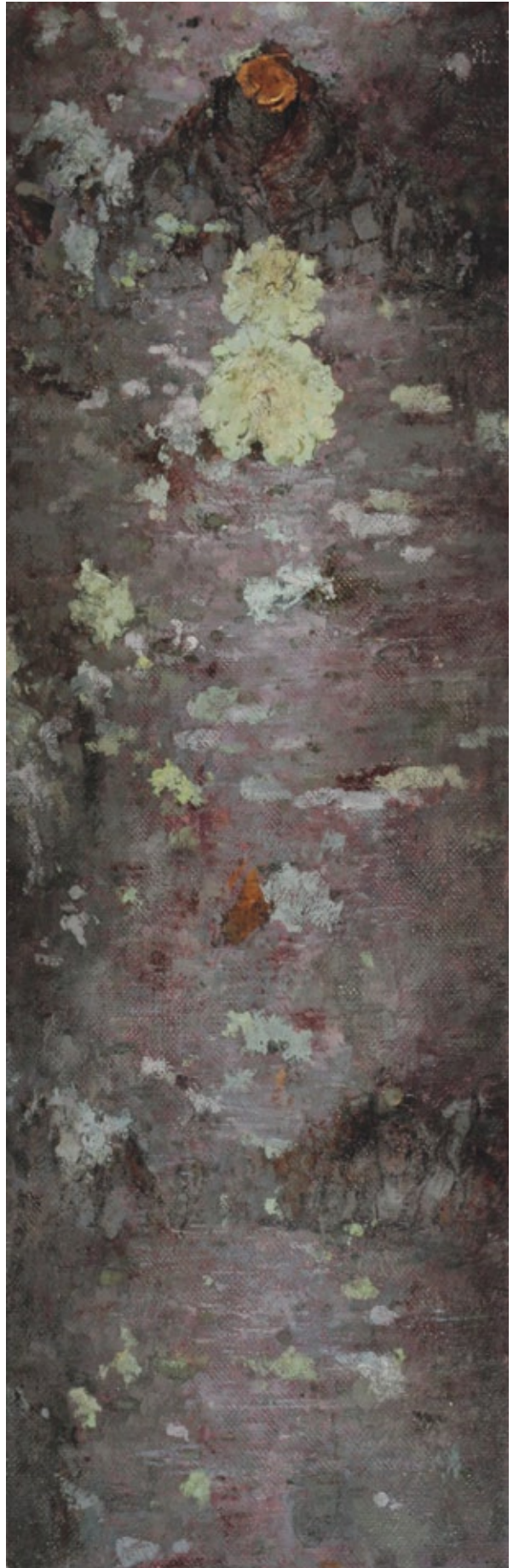
WHITE PINE, OIL ON LINEN, 30 X 9 3/4"